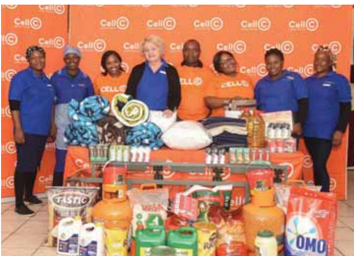
Grace Help Centre received the donations from Cell C employee volunteers.

Rustenburg – Mobile telephone company Cell C has donated groceries, blankets and gas stoves to Grace Help Centre in Rustenburg as a gesture of goodwill and in line with its corporate social responsibility policies. Grace Help Centre provides protection and shelter to women and children who have been victims of abuse, rape and neglect.